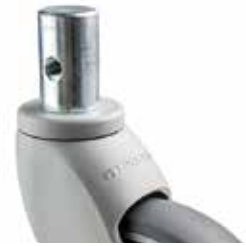
CUSTOMISED STEM FITTING